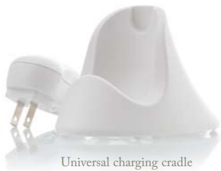
Universal charging cradle

For proper charging place handle in the charging cradle as shown